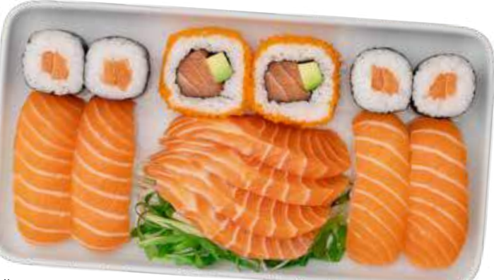
all salmon love set 💙

2 YO! rolls, 2 salmon maki, 2 tuna maki, 2 salmon nigiri, 2 tuna nigiri, 2 thick cut slices of salmon & 2 tuna sashimi 492kcal £17.50