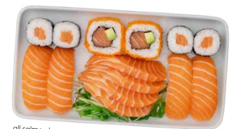
all salmon love set